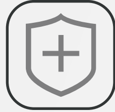
Silicone protective case