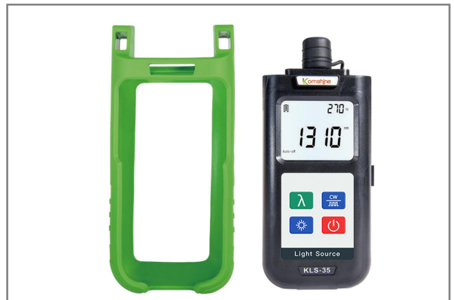
Detachable protective sleeve