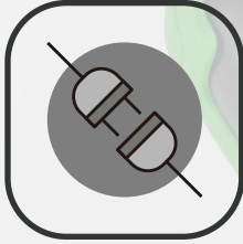
Plug and play